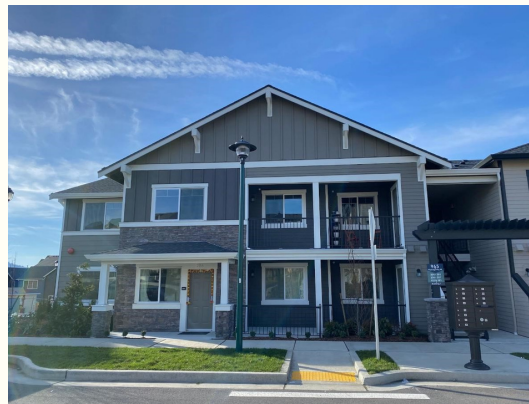
Westridge - Issaquah, WA. 80% ami