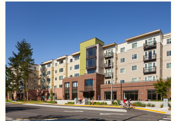
John Gabriel House - Redmond, WA. 40-60% ami