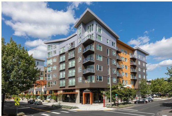
Milehouse - Redmond, WA. 80% ami