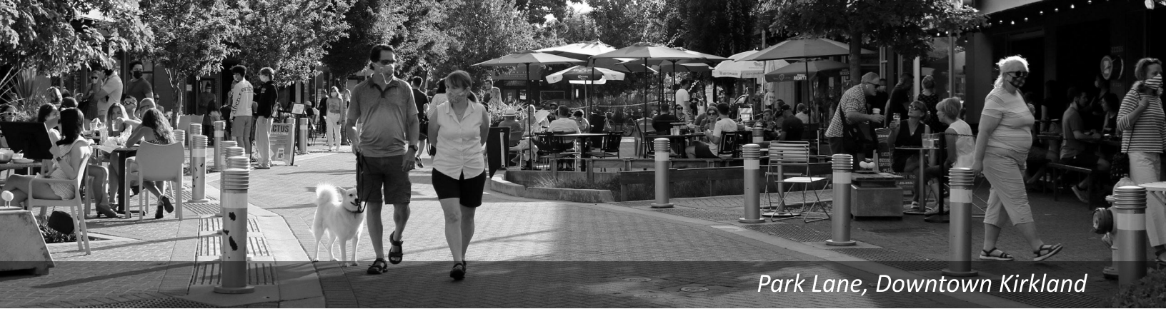
Park Lane, Downtown Kirkland