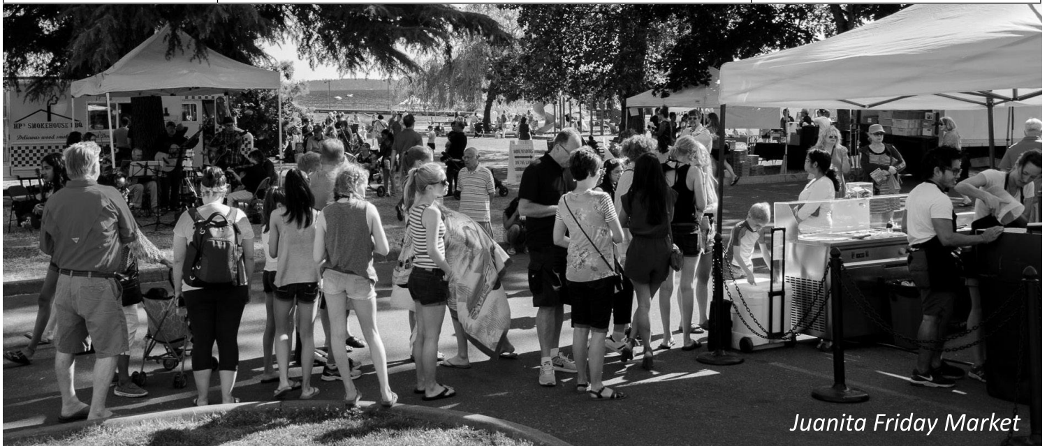
Juanita Friday Market